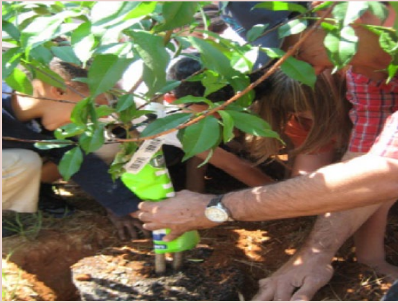
Figure 1. Students get their hands dirty working in the school garden.

change lives. In every cluster, students engage in service-learning projects where they create products—websites, videos, pictures, prototypes, school gardens, clubs, and so on—that address the problems they posed at the cluster's onset to improve their school and/or surrounding community.